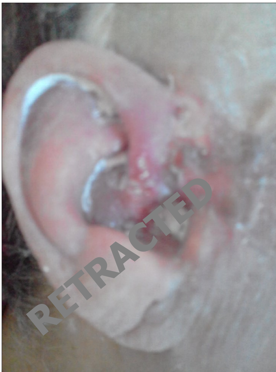
Figure 5. Right ear; Basal Cell Carcinoma (BCC) seen in the skin of ear and adjacent areas, removal of cancer cells after Bee Venom subcutaneous injection.