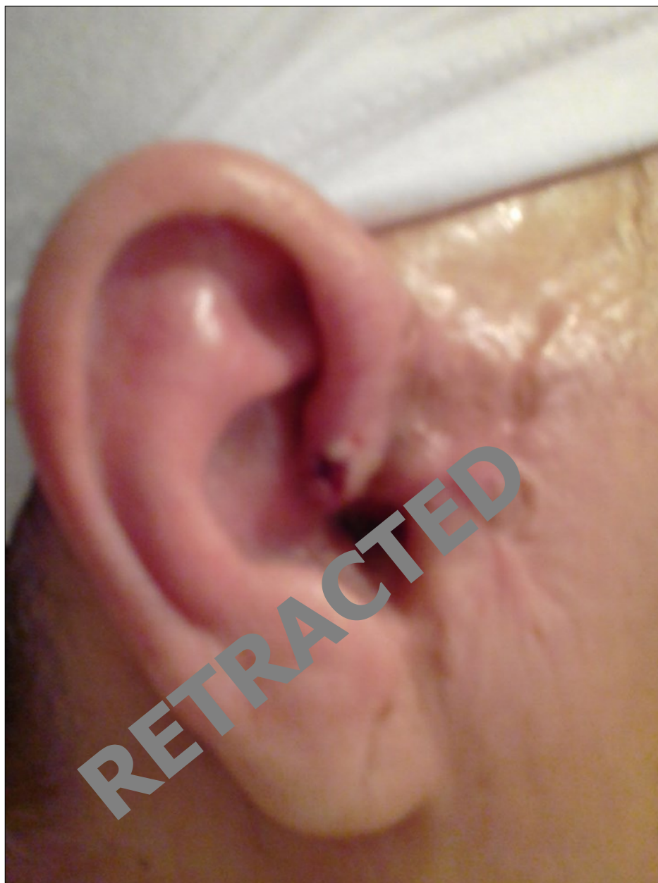
Figure 7. Right ear; complete recovery of Basal Cell Carcinoma (BCC) seen in the skin of ear and adjacent areas, removal of cancer cells after Bee Venom subcutaneous injection.