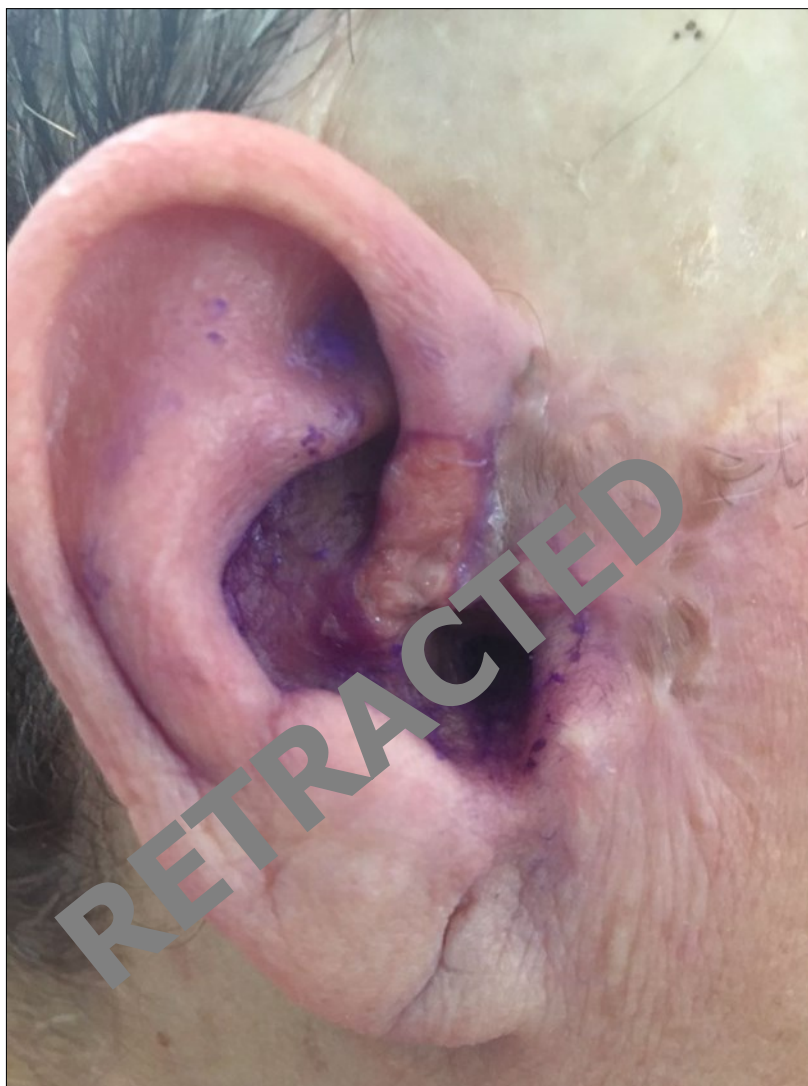
Figure 6. Right ear; Basal Cell Carcinoma (BCC) seen in the skin of ear and adjacent areas, removal of cancer cells after Bee Venom subcutaneous injection.