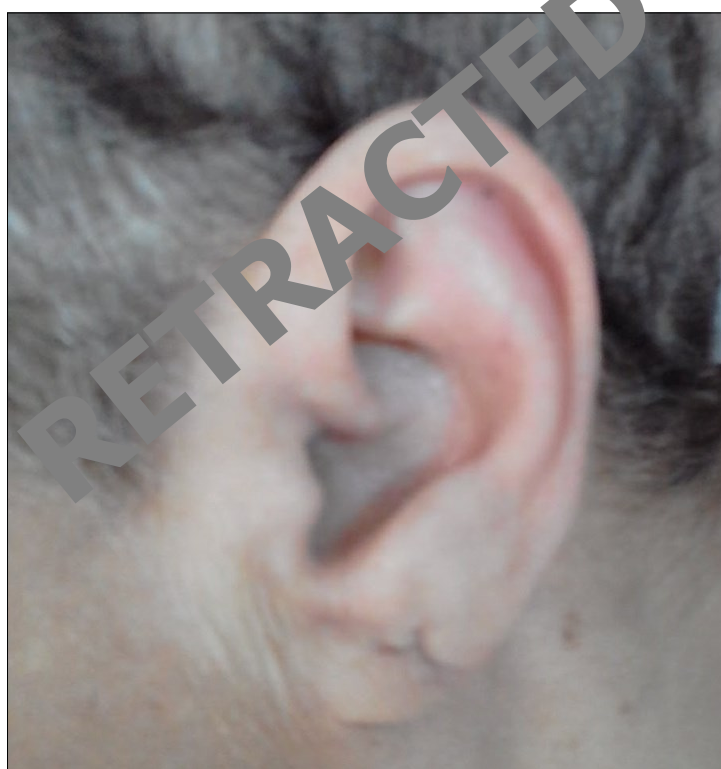
Figure 2. normal left ear