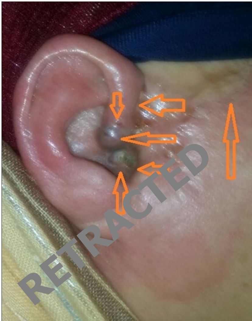
Figure 3. Right ear; Basal Cell Carcinoma (BCC) seen in the skin of ear and adjacent areas, slight edema seen after Bee Venom subcutaneous injection.