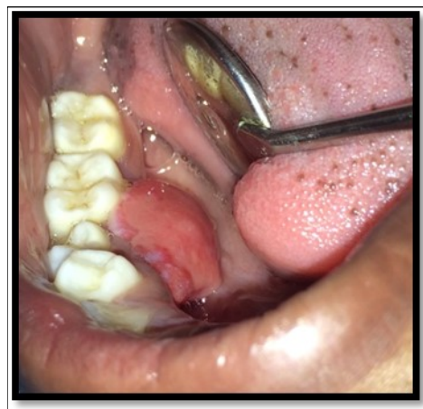
Fig 1: Pre operative size and extent of lesion

During the next visit local anesthesia was given.