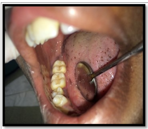
Fig 4: One month follow-up

H & E stained section shows trabecular bone and woven bone more towards the center of the lesion