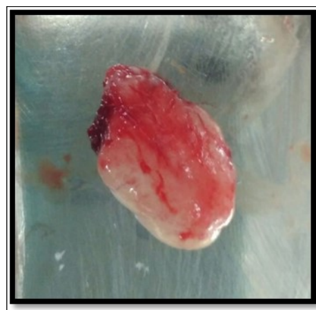
Fig 2: Excised lesion