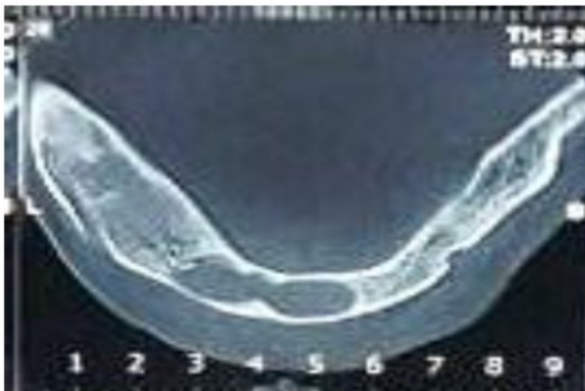
Figure 3. The panoramic radiograph showing multiple cysts in the maxilla and mandible

The panoramic radiographs showed seven cysts in the mandible and maxilla. The patient was then referred to the surgical unit of the School of Dentistry. A CT scan was performed in order to better examine the patient and the images obtained revealed multiple extended cysts in the posterior and anterior mandible and maxilla with no swelling. The CT scan and panoramic radiographs showed multiple radiolucencies with well-demarcated borders, cortical margins and different sizes (Figures 3 and 4). The interpretation of the radiographic images diagnosed the patient with radicular cysts and odontogenic keratocysts. The clinical examination of the patient revealed no systemic diseases or symptoms in the skin and the involved areas. The chest and skull radiographs also showed no symptoms.